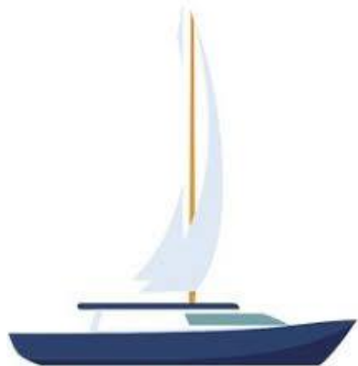
BIG FISH BAY

Campers are asked NOT to bring expensive items not needed for Day Camp, such as electronic games, MP3 players, etc.